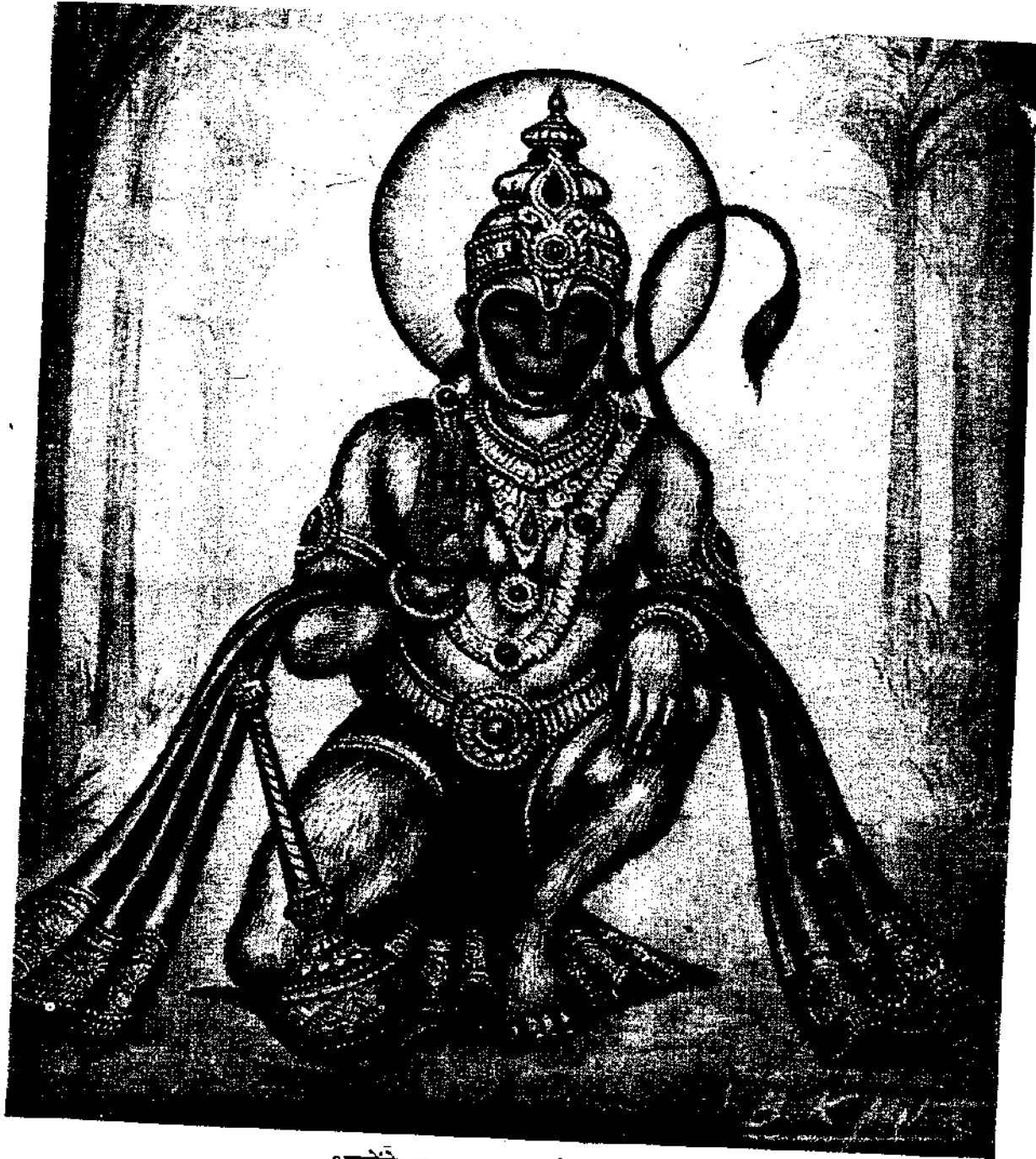
भक्तोंके परम आराध्य श्रीहनुमान्जी